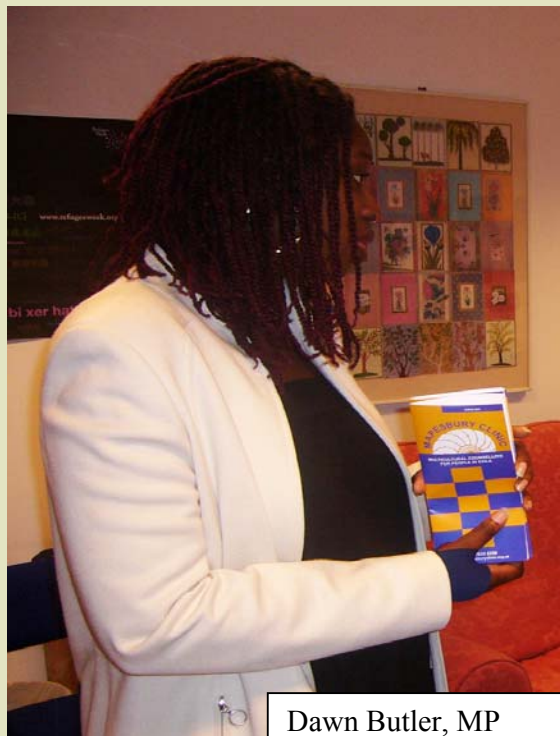
Dawn Butler, MP

Refugee week 2007 celebration at Mapesbury Clinic was marked by the visit of Dawn Butler, Labour MP for South Brent to the Minster Centre. What a privilege!!